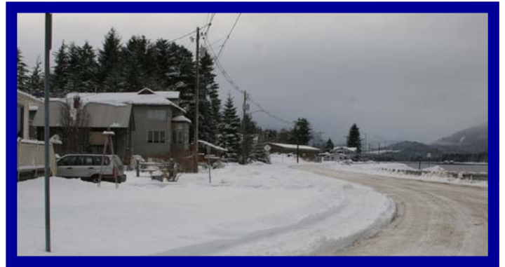
Street leading to downtown Petersburg