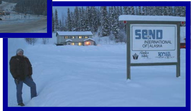
SEND International of AK Headquarters