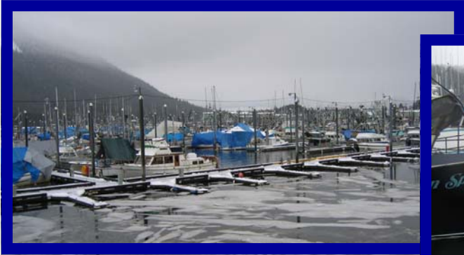
Harbor - Petersburg, AK