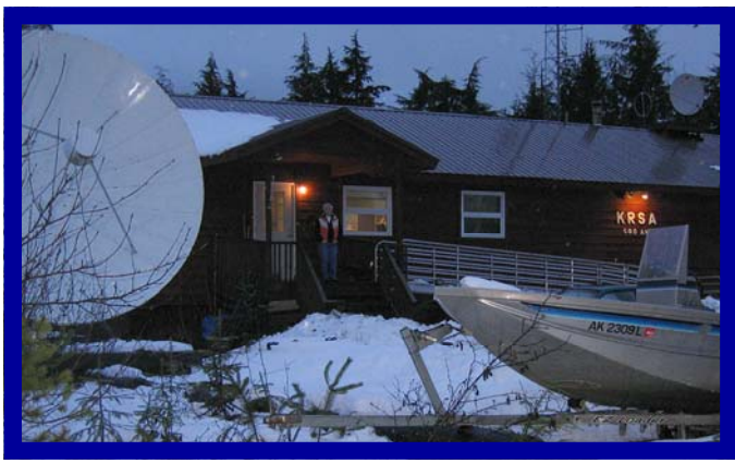
KRSA Building - Petersburg, AK