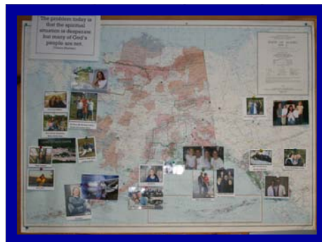
Alaska map showing missionary photos of Church Plants and ministries