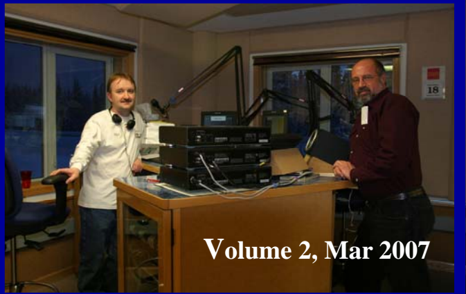
Volume 2, Mar 2007