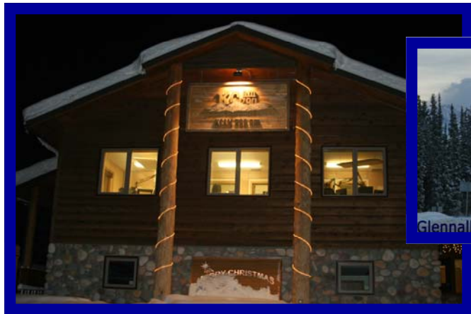
KCAM Building - Glennallen, AK