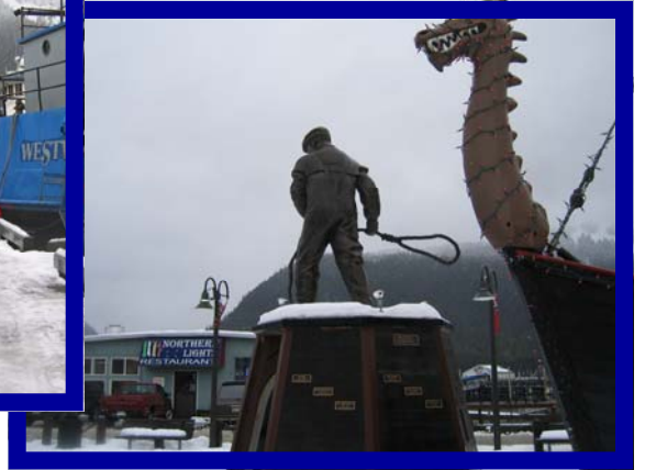
Bojer Wikan Fishermen's Memorial Park Sponsored and maintained by Sons of Norway, Fedrelandet #23